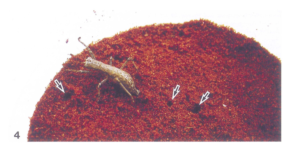
Fig. 4 Oviposition in Karoophasma biedouwensis . A mated female deposited eggs with a cementing material mixed with sand. Arrows indicate traces of her search for the best site to oviposit.