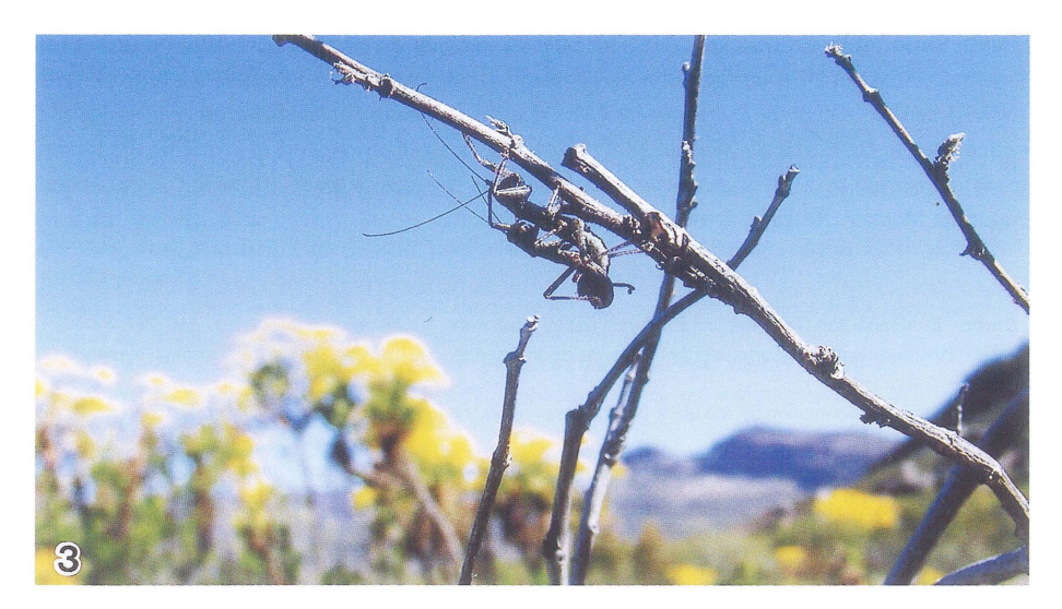
Fig. 3 Mating of Hemilobophasma montaguensis observed in the field. The small and slender male on the female's back inserted his penis into the female's genitalia by twisting his abdomen around hers from the right side.

times at intervals of a few days (about 3–4 days). We calculated that one female lays 50–100 eggs in total during her lifetime. Despite the hardness of the egg pod, it softens under high humidity or immersion in water. Such a change under wet conditions may be inevitable for the hatching of the first instar nymphs. In fact, we observed in the field many first instar nymphs of K. biedouwensis hatch out one or two weeks after the first rains in winter (late August to early September).